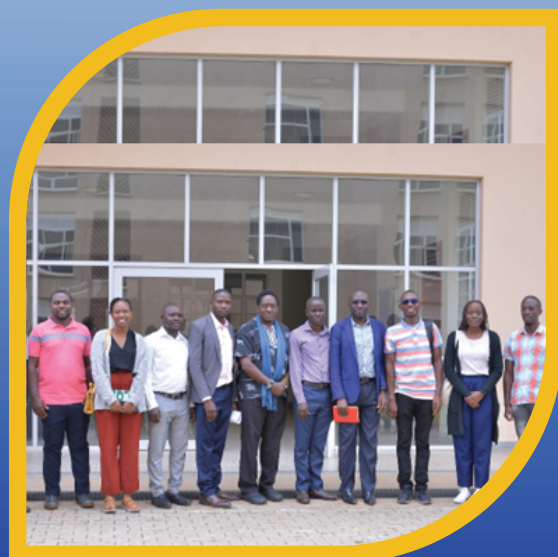
First-ever MSc.BME class