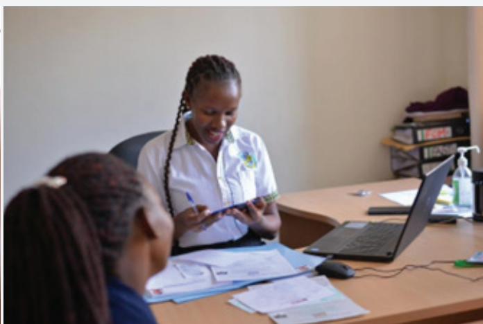
Verification of Academic documents