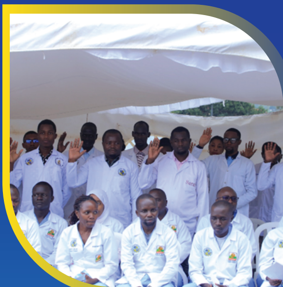
White Coat Ceremony

Congratulations and welcome to MUST. Succeed we MUST