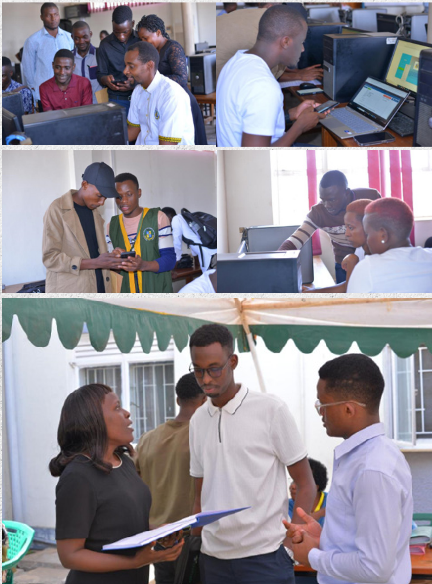
International Relations Officer helping out International students