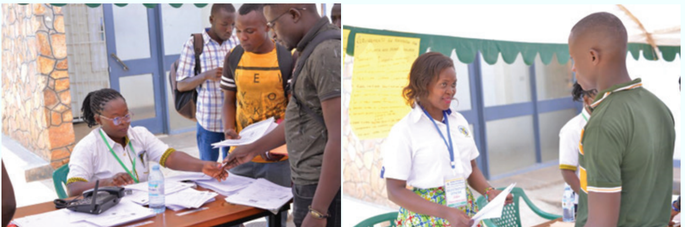
Biodata and document presentation

According to the registration guidelines shared with all students both online and in hard copies, for one to be registered he/she had to have the registrars verify their biodata, academic documents and other relevant documents (academic documents, payment slips, identification cards of the former school or the national one, birth certificate and a copy of the admission letter).