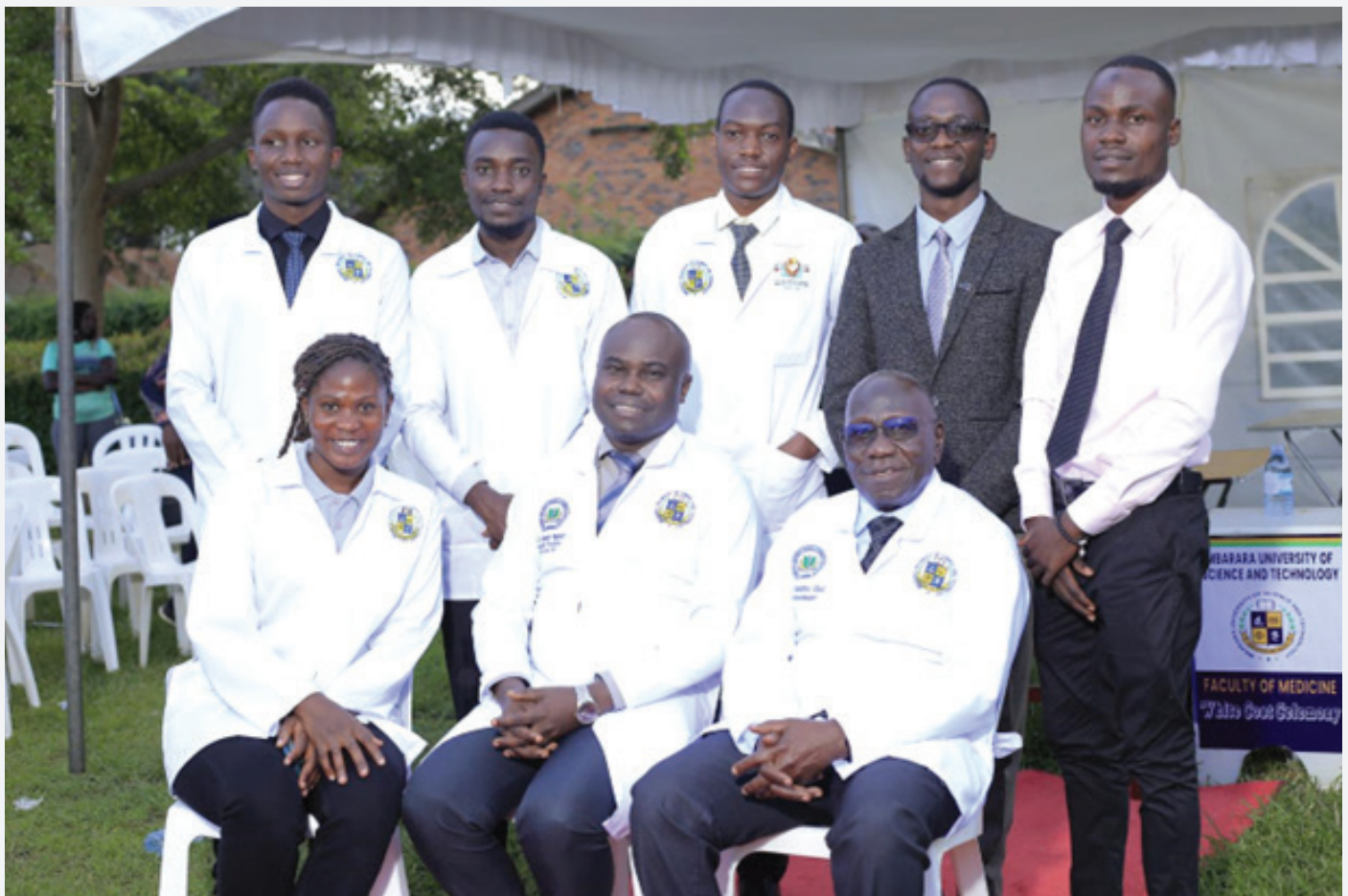
Presidents of the different medical school Association