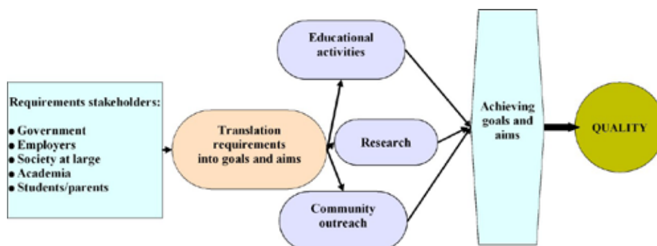
Figure 1: Quality as an object of negotiation between the relevant parties

With so many stakeholders and players in the field it is not easy to find a definition of quality because each stakeholder has its own ideas and expectations. We may therefore say that Quality is a matter of negotiating between the academic institution and the stakeholders . In this negotiation process, each stakeholder needs to formulate, as clearly as possible, his/her requirements. The university or faculty, as ultimate supplier, must try to reconcile all these different wishes and requirements. Sometimes the expectations will run parallel, but they can just as well end up in conflict. As far as possible, the requirements of all stakeholders should be translated into the mission and goals of an institution and into the objectives of a faculty and of the educational program and as far as this concerns research, the research programs. The challenge is to achieve the goals and objectives. If this is the case, then we can say that the institution, the faculty has quality (see Figure 1).